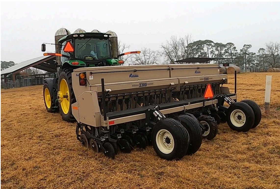
No-till drill used to plant seeds of different sizes.

When reseeding completely is called for, you will need to suppress or eliminate the existing vegetation. There are two common methods to completely reseed - conventional tillage and no-till seeding. Conventional tillage - plowing and disking the field to prepare a good seedbed - is a viable option if the soil is not too steep or rocky. No-till seeding, where the existing sod is killed or suppressed by herbicides or intense grazing before introducing seed with equipment that can place it in the soil, requires less time and fuel, and is better adapted to areas where tillage is not appropriate.